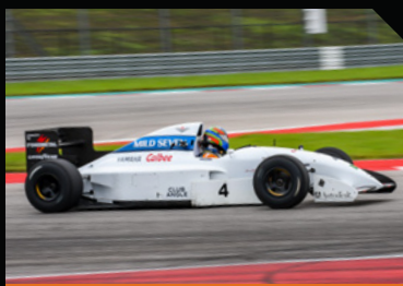
Tyrrell 1994 Formula 1