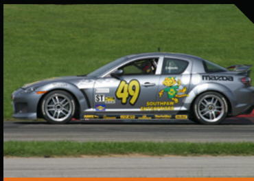
Mazda RX8 Continental ST