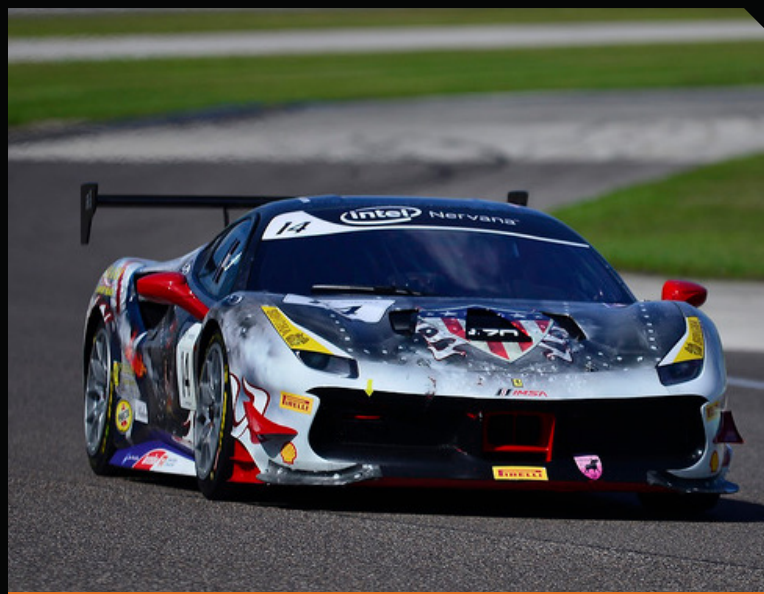
Ferrari Challenge 488