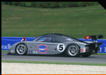
Crawford Grand Am DP