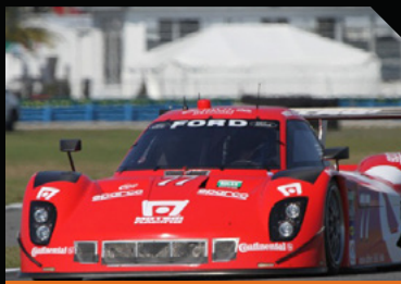
Doran Grand Am DP