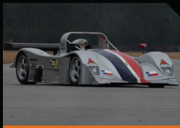
Lola B2K40 ALMS P2