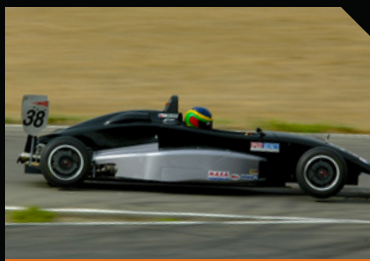
Formula Renault 1600