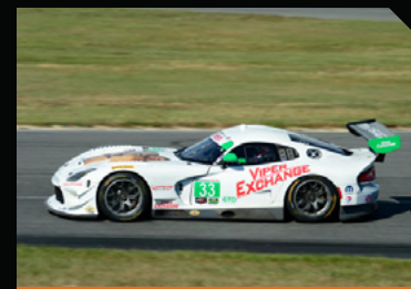
Dodge Viper GT3