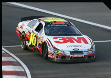
NASCAR Nationwide Series