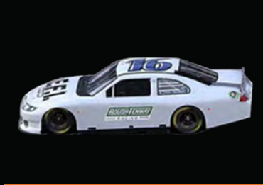
NASCAR Sprint Cup Series