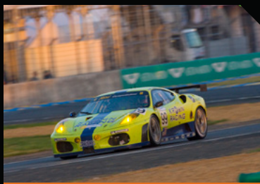
Ferrari 430 GTLM ALMS