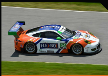
Porsche GT3 R