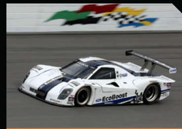
Riley Gen 3 Grand Am DP