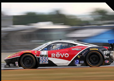
Ferrari 458 GT3