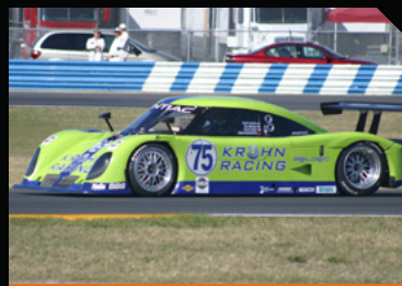
Riley Gen 1 Grand Am DP