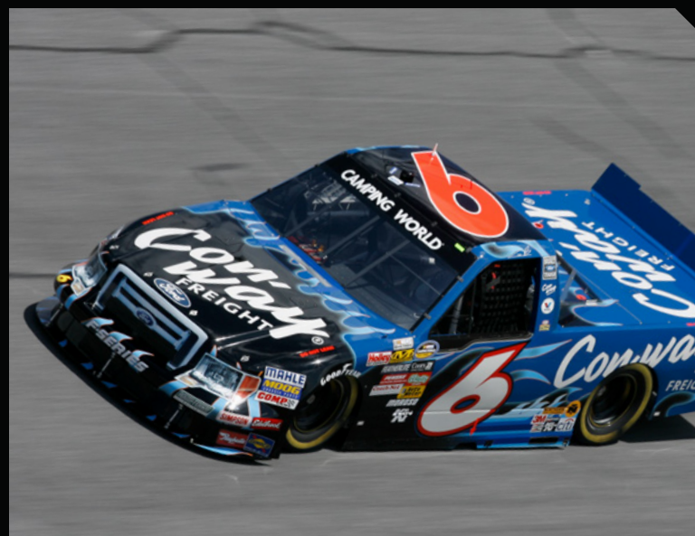
NASCAR Camping World Truck Series