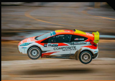
GRC Supercar Lites