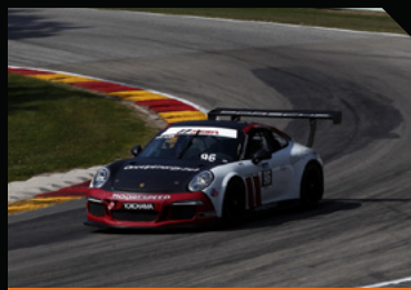
Porsche 991 GT3 Cup