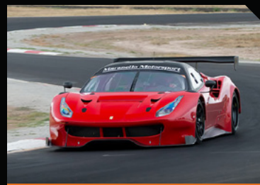
Ferrari GT3 488