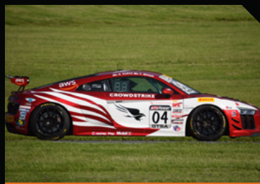
Audi R8 GT4