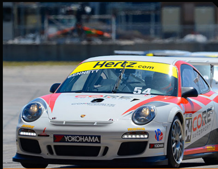
Porsche 997 GT3 Cup