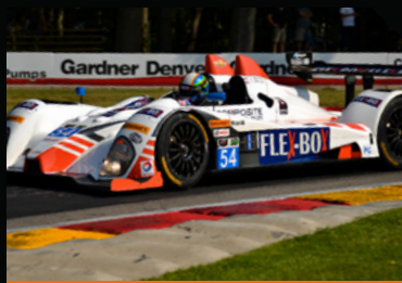
Oreca FLM09 PC