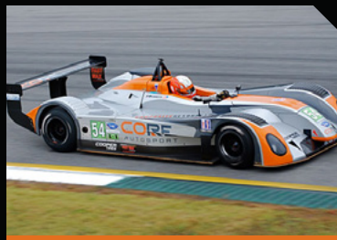
Elan IMSA Lites