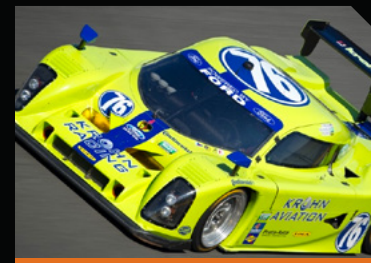
Lola Grand Am DP