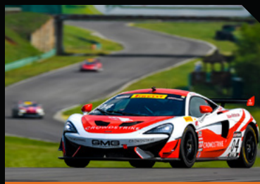
McLaren 570 GT4