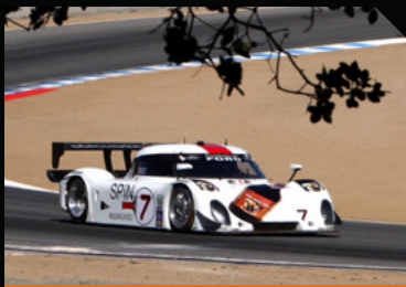
Riley Gen 2 Grand Am DP