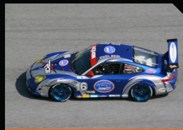
Porsche 996 Grand Am GT