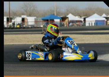
Japan Sugo Cart