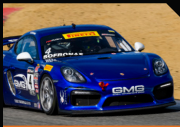
Porsche Cayman GT4