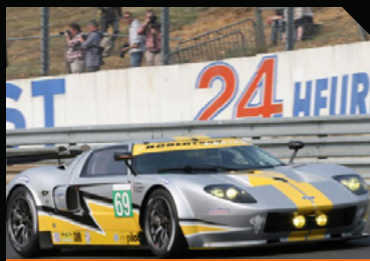
Ford GTLM ALMS