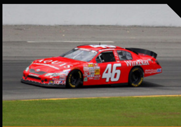
NASCAR K&N East/West