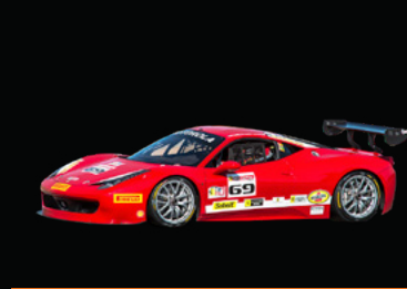
Ferrari Challenge 458