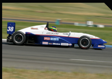
Formula Renault 2000