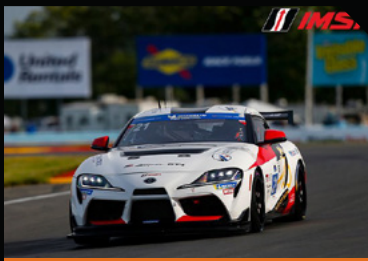
Toyota Supra GT4