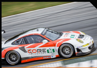
Porsche 997 GTLM - ALMS