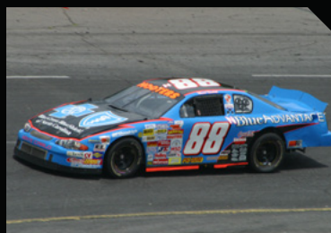
NASCAR Pro Cup